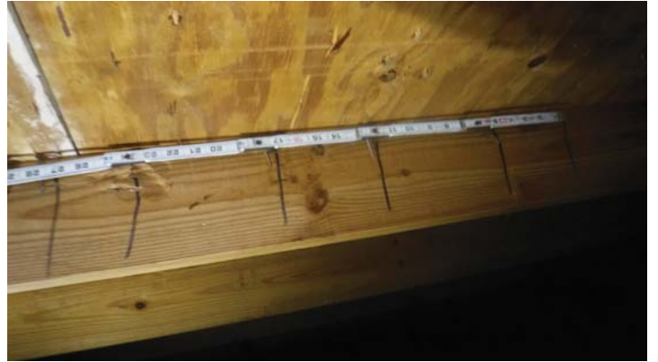
6in nail patten