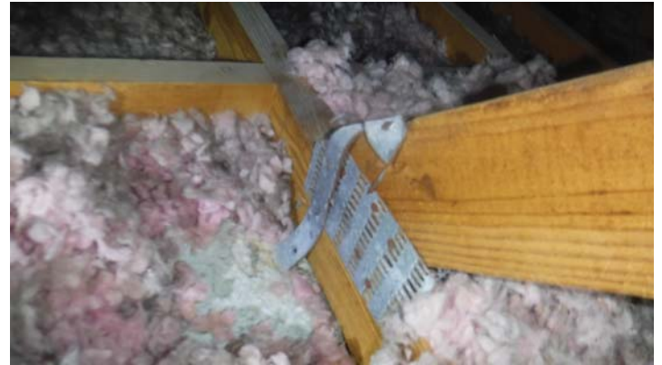
Single wraps - one wrap correct with 3 nails