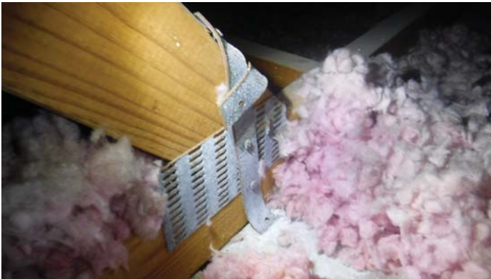
Single wraps - one wrap correct with 3 nails