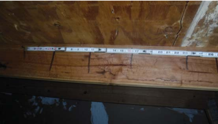
6in nail pattern