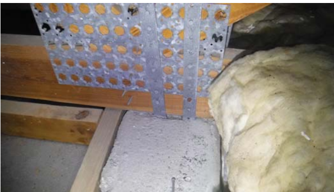
Clips - with minimum three nails