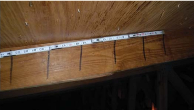
6in nail pattern