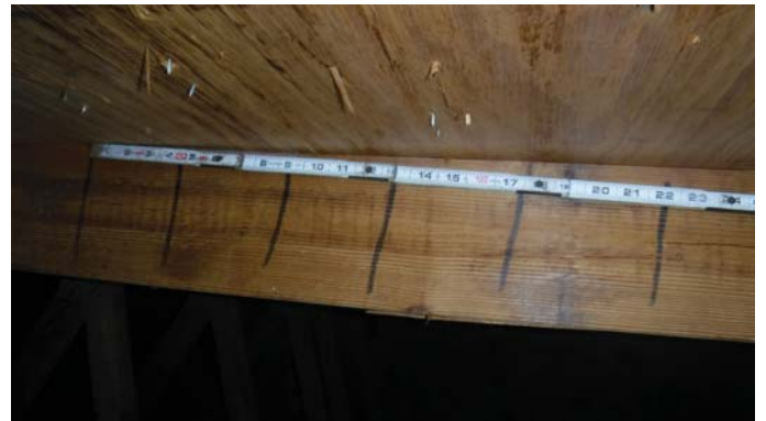
6in nail pattern