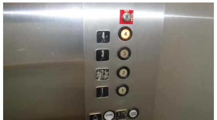
Four Story building